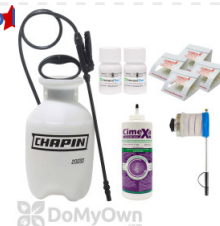
★★★★★ General Pest Control Starter Kit