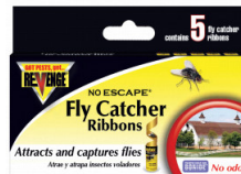
2 Fly Catcher Catcher F