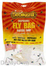
Catchma: Disposab (975-8)