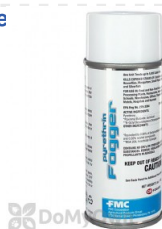
Pyrethrin Fogger (16)