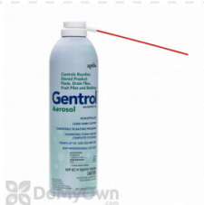
Gentrol A 16 oz. can