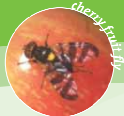
cherry fruit fly