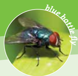
blue bottle fly