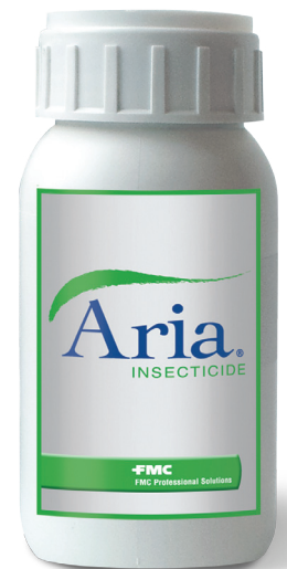
One capful = 20 g

For more information on Aria insecticide, contact your FMC Market Specialist or local FMC Distributor.