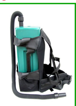
Optional Back Pack Harness