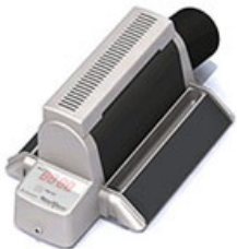
NightWatch Bed Bug Monitor

After treating the mattress and letting the chemicals dry, you can protect your mattress and box spring with a Protect-A-Bed Bed Bug Proof Encasement. These high-quality terry cotton covers are certified 100% bed bug escape and bite proof, yet they are still cool and comfortable to sleep on. Any bed bugs you seal up in the covers will eventually die, allowing you to keep your mattress and box spring without throwing them out. In addition, mattresses and box springs covered with a Protect-A-Bed cover are easier to treat and clean and provide fewer areas for bed bugs to harbor and hide. Infested mattresses and box springs should be covered for at least one full year to make sure that all bed bugs hiding within will die. You can spray the outside surfaces (including tufts, folds and seams) of mattress covers during re-treatments, but do not remove the covers. These covers are sold separately on our website.