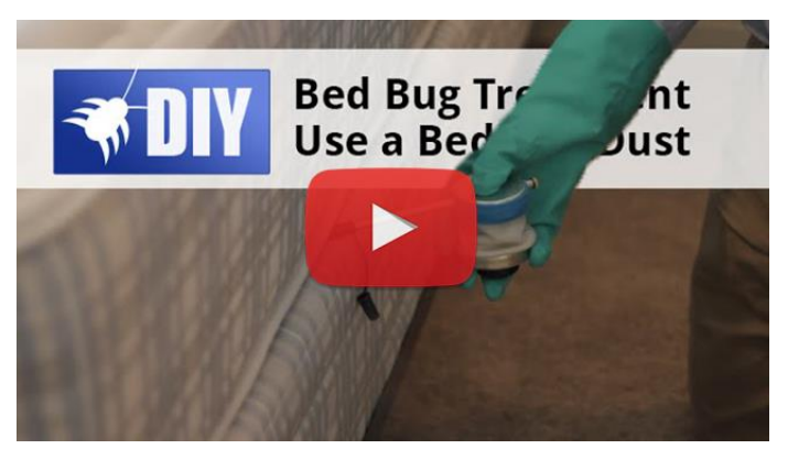
Bed Bug Treatment Video Available on DoMyOwn.com