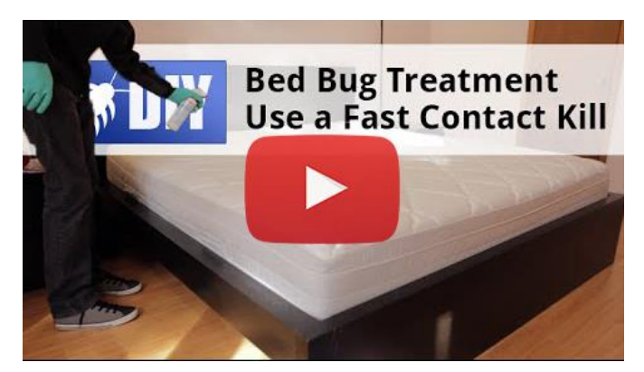
Bed Bug Treatment Video Available on DoMyOwn.com