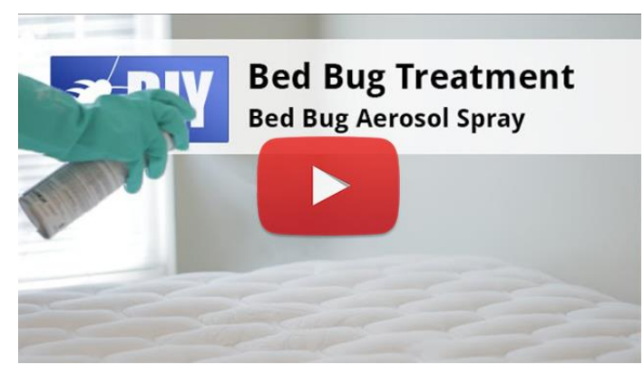
Bed Bug Treatment Video Available on DoMyOwn.com

Bed bug aerosol sprays come with a straw applicator to make it easier to apply into the cracks and crevices of furniture and mattresses around the affected rooms. Don't forget to apply in drawers, picture frames, bed frames, and any other cracks you can find. You will want to allow this part of the treatment to dry before moving on.