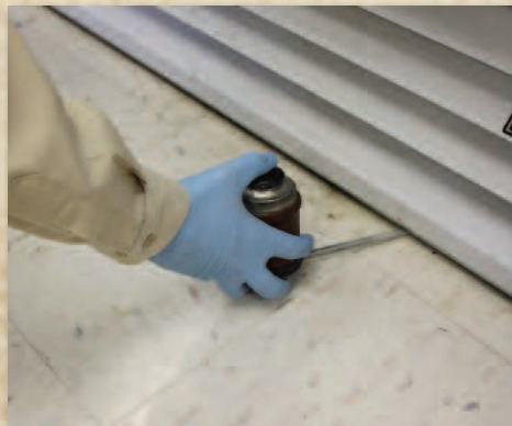
Dusting Nibor-D under refrigerator