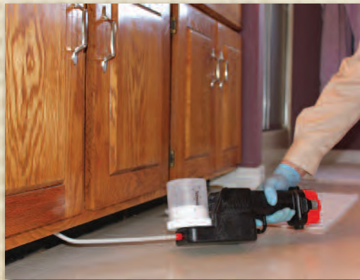
Dusting Nibor-D under cabinets