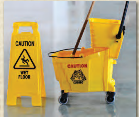
Using Nibor-D as a mop solution