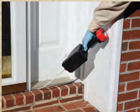
Dusting Nibor-D under along windows