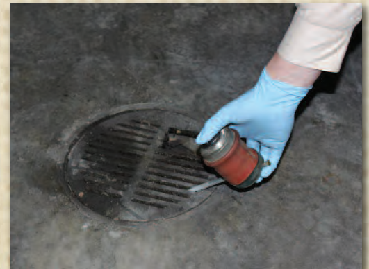
Dusting Nibor-D in drains