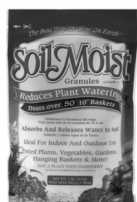
8 oz. Bag 1 lb. Bag