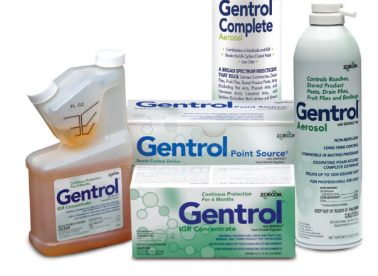
Gentrol® Family - Aerosols, Concentrate, and Point Source Synthetic insect growth regulators