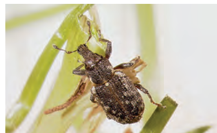
ANNUAL BLUEGRASS WEEVIL