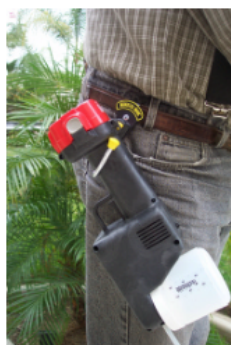
Monster Hook for easy tote