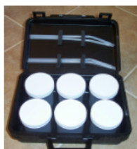
Canister storage Case