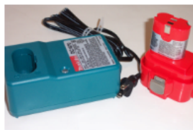
Battery and Charger Car charger Available