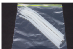
Bag of Ten Wands