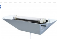
Flyweb Fly Light