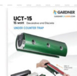
Gardner Under Counter Fly Light Trap