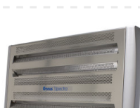
Genus S Fly Light