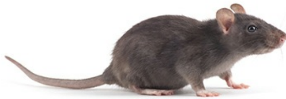
Roof Rat 5-10oz 10-12" long

Also known as black rats (even though they vary in color), roof rats are rodents that explore both indoors and outside and can be found on roofs, in attics, rafters, the tops of trees, and other high places around your home. These rats are omnivores, eating foliage like seeds, leaves, and stems in addition to small prey like birds and insects. They will also eat crops if they have access to them. Roof rats eat about 15 grams of food per day and drink 15 milliliters of water per day. They weigh between 2-8 ounces and their bodies are 5 to 7.5 inches long. Their tail will be equally as long.