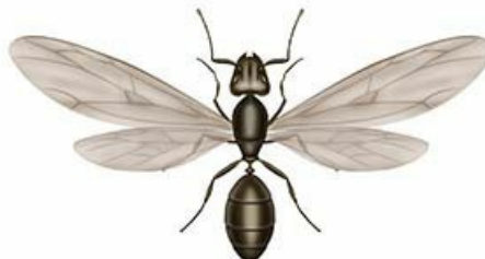
Top: Termite with Wings, Bottom: Ant with Wings

Termites, both drywood and subterranean, differ from ants in the following ways: