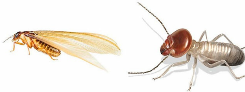
Left: Drywood Termite, Right: Subterranean Termite