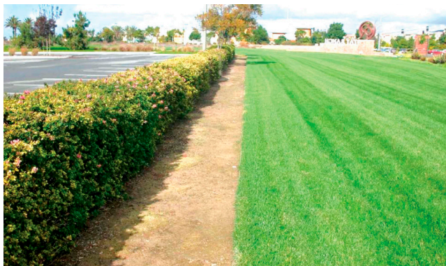
Finale herbicide can be used to edge perennial beds and keep turf from encroaching into the beds.