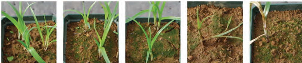
3 DAT Certainty® Herbicide 1.25 oz/acre