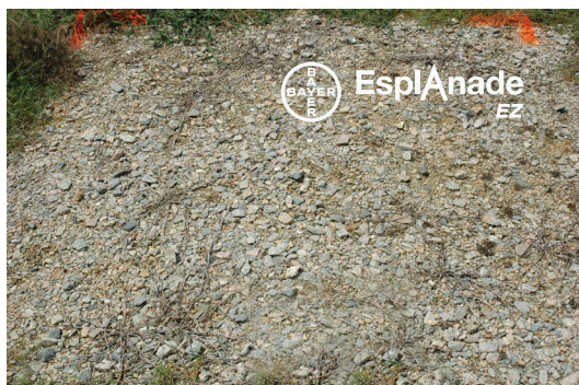
(5 months after treatment)