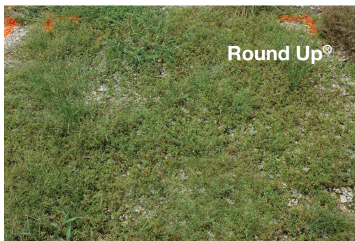
(5 months after treatment)

ALWAYS READ AND FOLLOW LABEL INSTRUCTIONS.