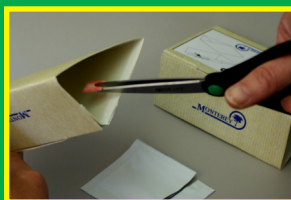
Place lure in trap